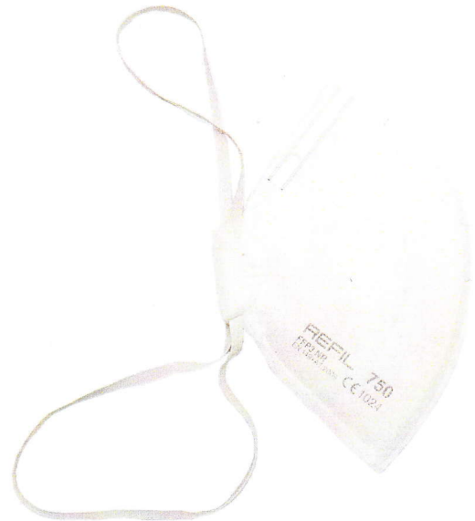
REFIL 750 FFP3 NR

The particle filtering half mask REFIL 750 FFP3 NR and the derived version with a valve REFIL 751 FFP3 NR provides the protection of the respiratory system of a user against solid and liquid aerosols in the air in accordance with the information supplied by the manufacturer.