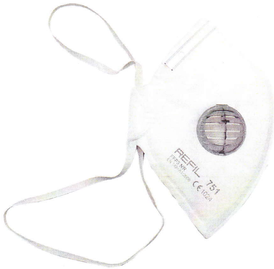
REFIL 751 FFP3 NR